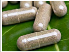
Frenzy over new "skinny pill". This Celeb doctor calls it the newest, fastest, fat buster...