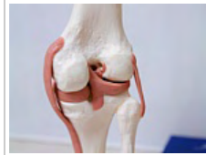
Shocking Joint Relief