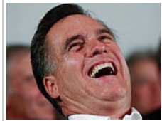
How penny stocks make millionaires every day...