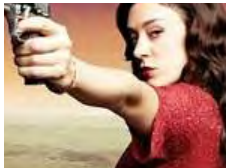
'Hit and Miss' will be missed